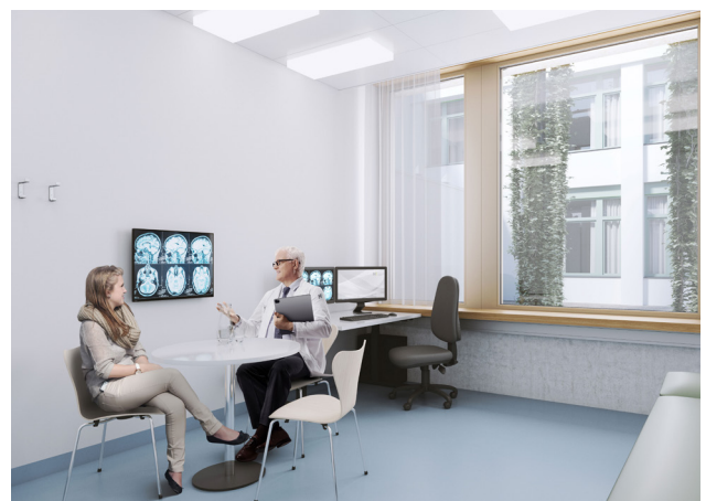
Consultation room: The modular, expandable double-tray luminaire can be adapted to any room use or standard requirements.

You can find more references and inspiration at www.tulux.ch/produkte/inspirationen