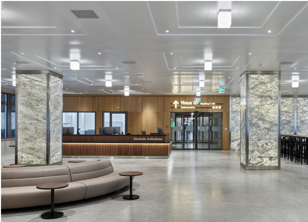
Entrance hall: The high-quality ambience is accentuated by the decorative cube light.