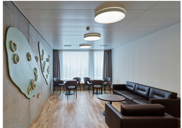
Lounge: The SPIN 2 lamp accentuates the cosy atmosphere.