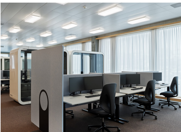
Office: The versatile double-tray light provides optimum illumination for focused work in modern offices.