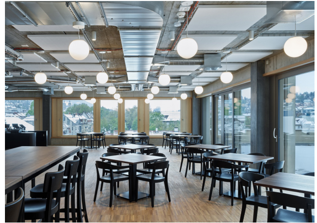
Roof Garden Restaurant: Classic pendulum-style spherical luminaire contrasts with the open ceiling, with visible installations.