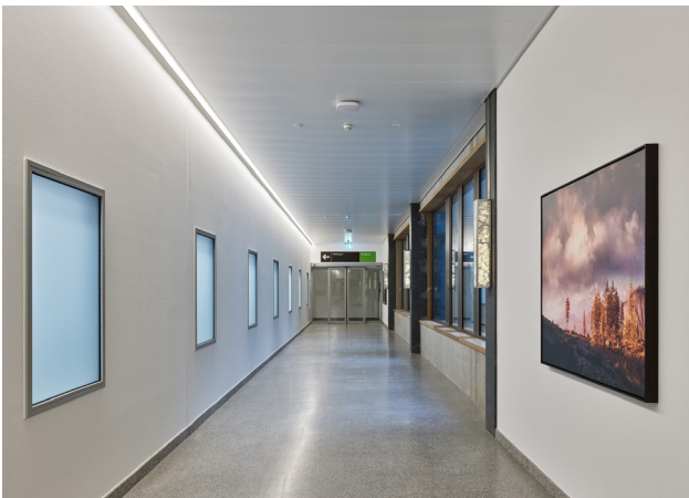
Corridor: The linear lighting supports the signage in the passage areas.